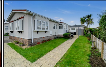
Pitch Fee: approx £198 per month Subject to Annual Review Council Tax Band: 'A' Tenu